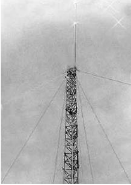
IQP - THE AERIALS