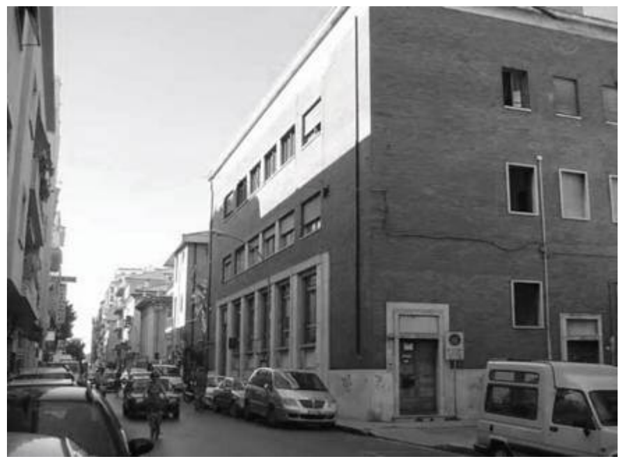
THE NEW BUILDING WHERE SAMBENEDETTORADIO - IQP WAS TRANSFERRED IN 1962 TO THE SECOND FLOOR