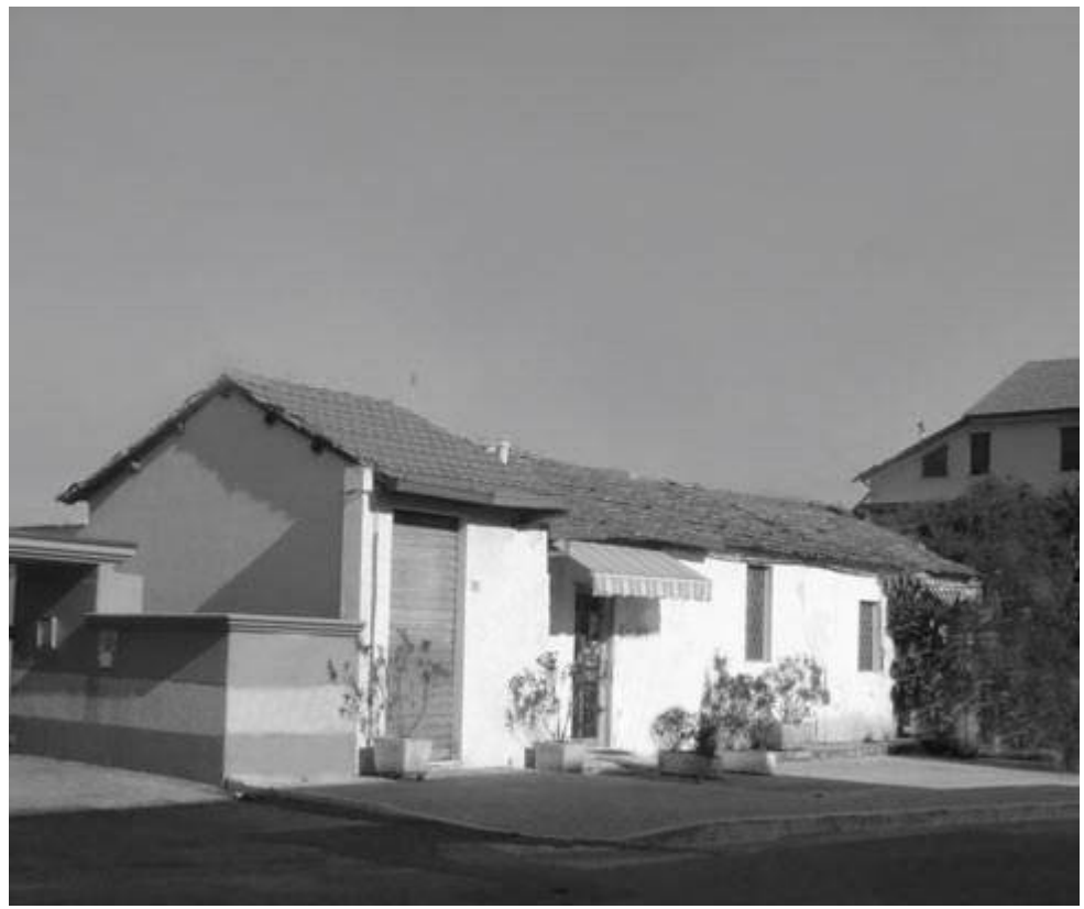
THE SMALL BRICK COTTAGE WHERE IQP SAMBENEDETTORADIO BORN IN 1945