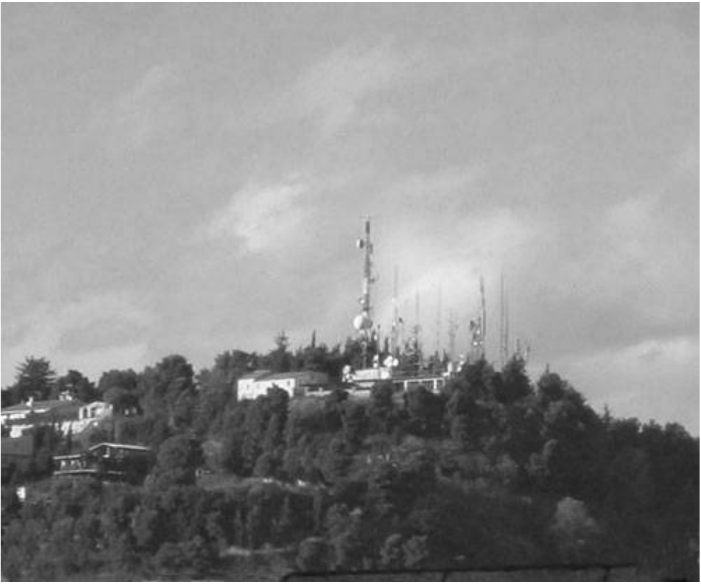
MONTESECCO AREA AND THE AERIALS IQP - SAN BENEDETTO RADIO

the small and romantic coastal radio station, built on the beach near the harbour, was transferred into a new building of the PP.TT. (Ministero delle Poste e delle Telecomunicazioni) located in the center of the city. Here the receiving and transmitting equipments were systemaized. I remember the enormous pylon on the stable summit and the long aerials on each quadrant. After some years the transmitter was set in Grottammare two km for from San Benedetto del Tronto, in the Montesecco area (on the top of a hill) about 150 mt. slm. IQP.