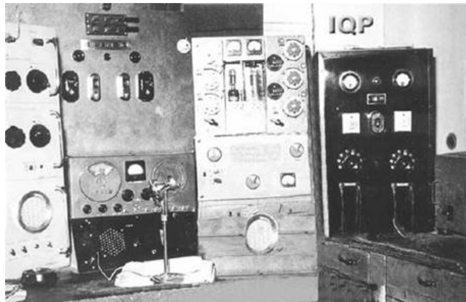
IQP - SAMBENEDETTORADIO – 1950